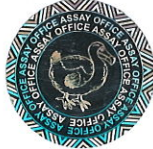
Magnified Image of Item